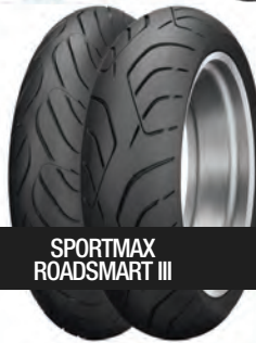
SPORTMAX ROADSMART III