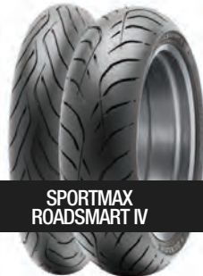
SPORTMAX ROADSMART IV